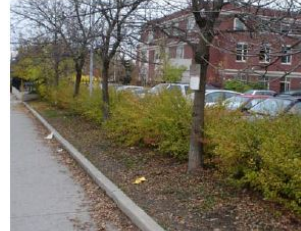
Figure 52a: This school site's parking lot is visually screened by a combination of trees and shrubs.

Provide a landscape buffer along the edge of parking areas in situations where they are along the public street. Provide breaks in the buffers to connect the sidewalk to walkways on the site. Buffers may include low shrubs, trees, and decorative fences.