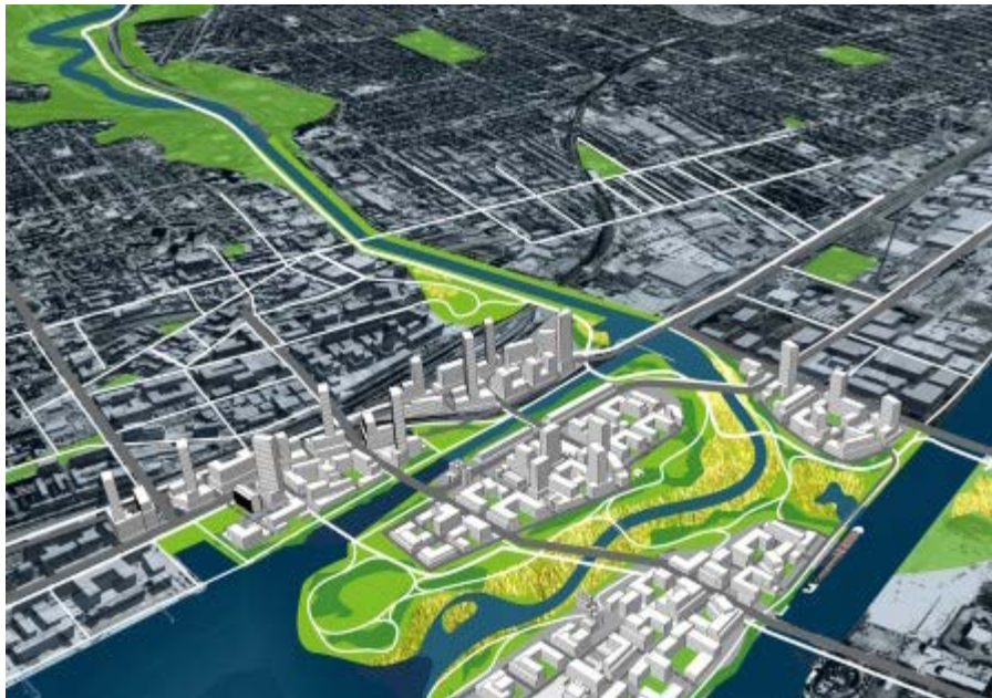
Figure 4: West Don Lands Concept Plan

The West Don Land's Flood Protection Landform has an objective of removing 210 ha of regulatory flood plain from an area in downtown Toronto. 62 A comprehensive redevelopment plan has been developed for the area including use of 32 ha of the area as a host site for the 2015 Pan Am Games and a 7.5 ha community park on top of the landform.