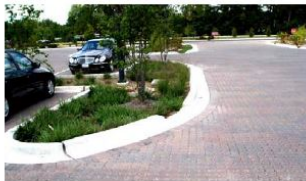
Figure 51b: Planting islands with depressed curbs allow stormwater to run from paved areas into the islands.