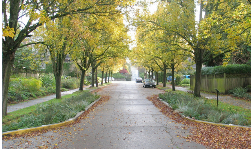
Figure 3: NE Siskiyou Green Street Retrofit Project, Portland, Oregon, U.S.A.