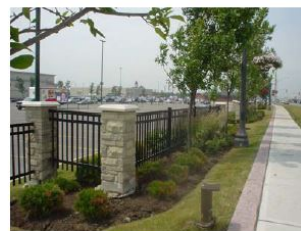
Figure 52b: Landscaped areas that are at least 3.0 metres wide provide both a visual and physical separation of parking areas from public sidewalks.