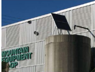
Figure 51a: This commercial building collects solar energy and rainwater.

Reduce and delay stormwater runoff from a property by using techniques such as stormwater retention gardens, green roofs, permeable paving and surfaces, and stormwater re-use.