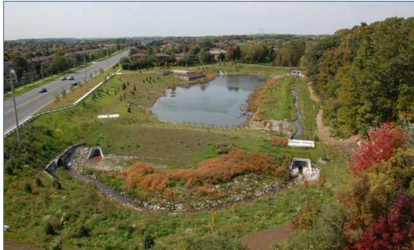
Figure 5: Pioneer Park Stormwater Management Facility

The Pioneer Park project is characterized in the research sources as the “first major stormwater facility rehabilitation in Canada”. Pioneer Park was the first of 10 planned major pond rehabilitation projects in Richmond Hill whose priorities and scope of rehabilitation were developed keeping in mind stormwater management adaptation opportunities. In particular for Pioneer Park: