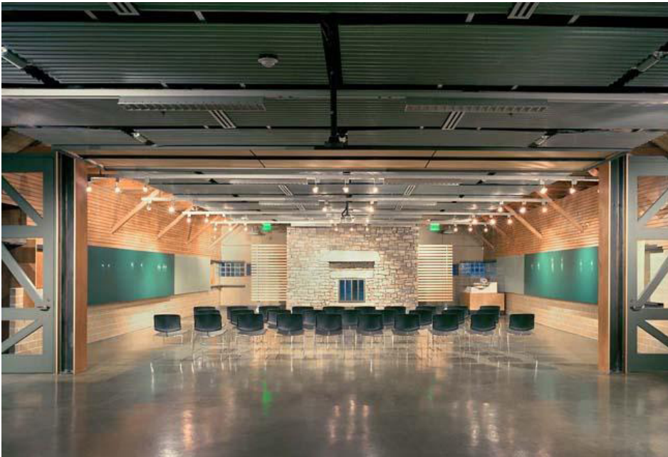
The Barn at Fallingwater (Pennsylvania) is an adaptive reuse of a 19th century barn. It includes a meeting centre and office space, and is the gateway to a conservation area.