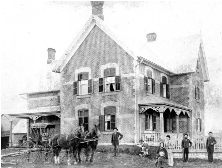
Bradley-Craig farmhouse, circa 1900.

The farm has been a landmark on Hazeldean Road for nearly 150 years. Rejecting the demolition proposal will allow this heritage and architectural treasure to remain an asset for years to come.