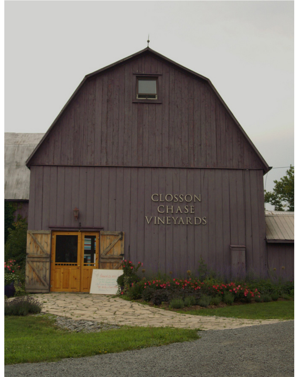
Closson Chase Vineyards (Prince Edward County, Ontario). This century barn was renovated in 2002 into a new winery with a barrel room, tasting room, and staff facilities. It's one of many examples of adaptive uses of barns for agriculture and tourism in the area.