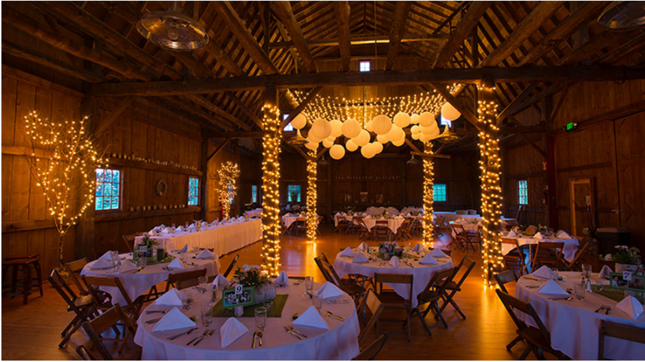
Garvey Farm (Michigan) is an award-winning adaptation of a late 19th century barn, used as a wedding and event venue.